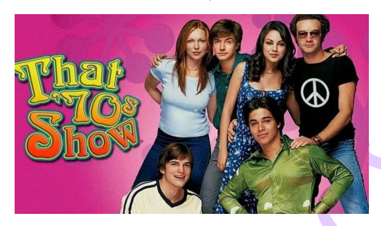
Task 1: Watch the introductory scene and circle the correct answer: